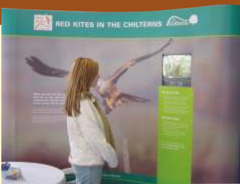
Red kite CCTV Nest Watch