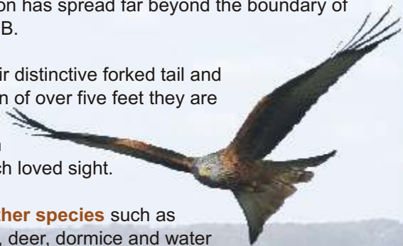
Bird watching on the Ridgeway

Many other species such as badgers, deer, dormice and water voles can also be found in the Chilterns. The area's rivers, streams, woodland and farmland are full of wildlife just waiting to be discovered.