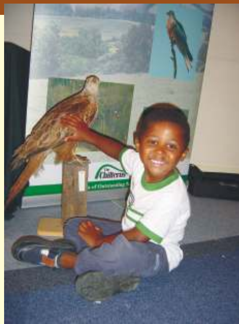
Fun day at Buckinghamshire County Museum

T he Chilterns Area of Outstanding Natural Beauty (AONB) is a fantastic place for wildlife and is home to the magnificent red kite, which was re-introduced here over 15 years ago. The Chilterns Conservation Board is the body responsible for protecting and enhancing the AONB and we are keen to help as many people as possible understand and enjoy this special area.