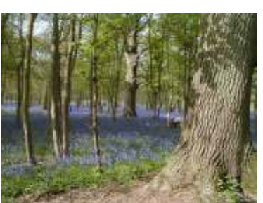
Bluebell wood - Steve Rodrici

Woodland covers over one fifth of the Chilterns AONB and is important for red kites which nest high in the tree tops. Many of the woods are ancient (pre 1600AD)but the well-known beech woods were